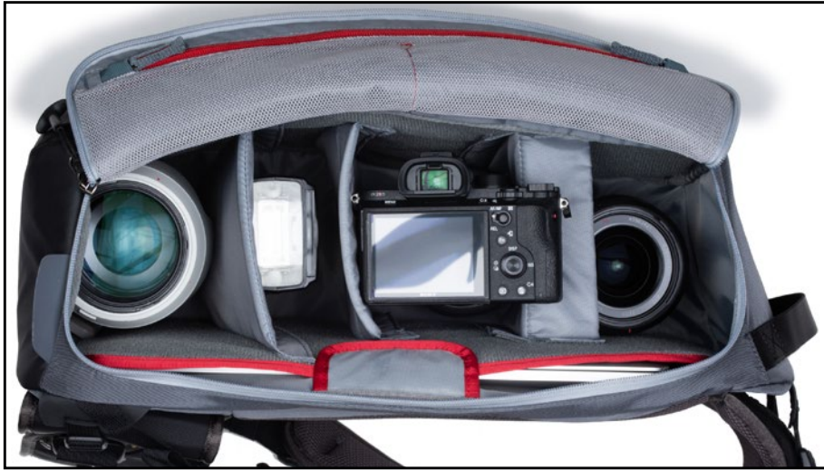
Sony A7RII with 24–70mm f/2.8 attached (hood extended), 70–200mm f/2.8 (hood reversed), 16–35mm f/2.8 and a flash

Fits an ungripped DSLR, 3–5 lenses including a 70–200mm f/2.8 attached and up to a 15" laptop.