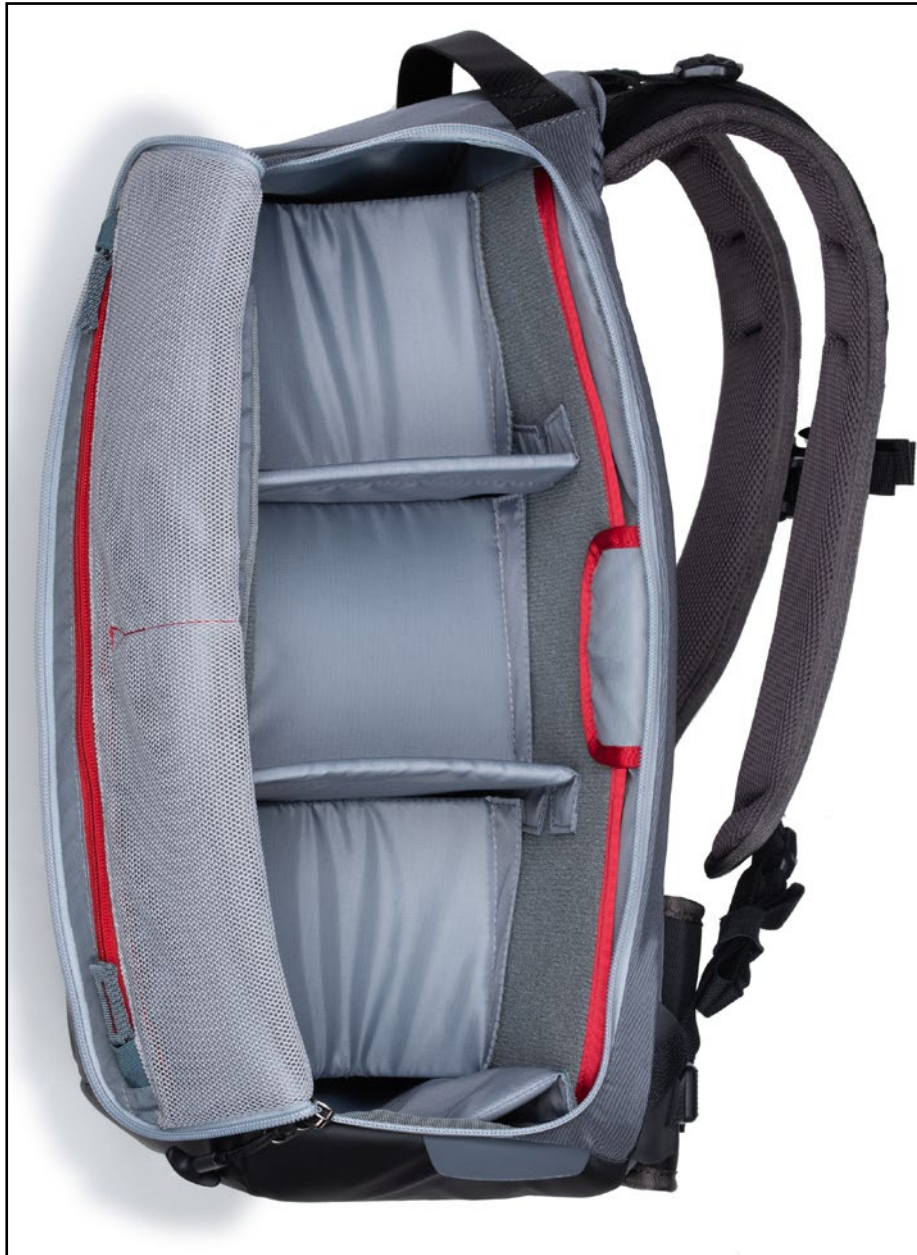
Fully-customizable interior dividers for photo or personal gear