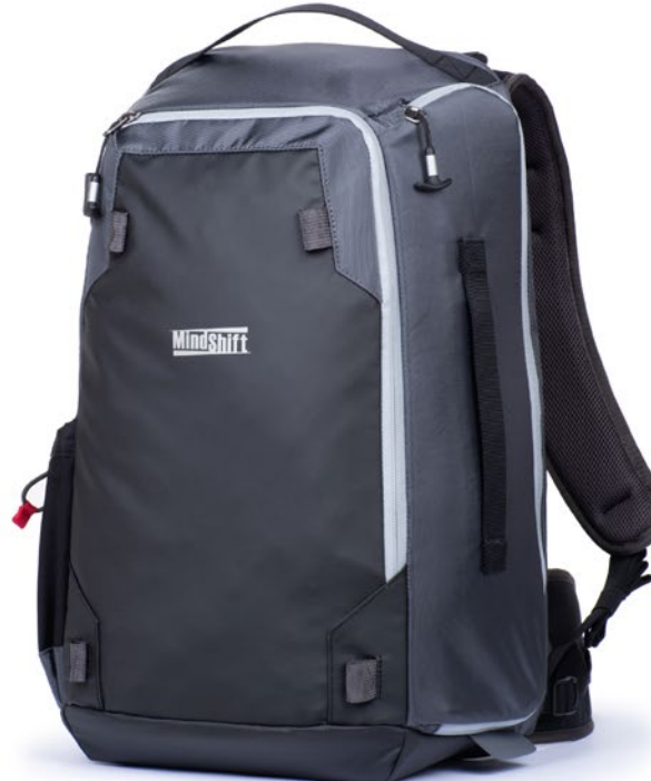
PhotoCross Backpack 15 Carbon Grey