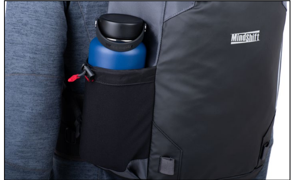
Water bottle pocket locks in most 1 liter bottles