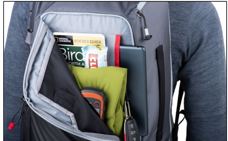
Easily accessible front pockets for filters, snacks, or a light layer