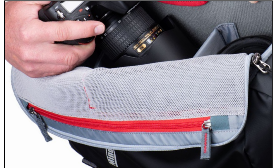
Internal zippered pockets for batteries, memory cards or other small accessories