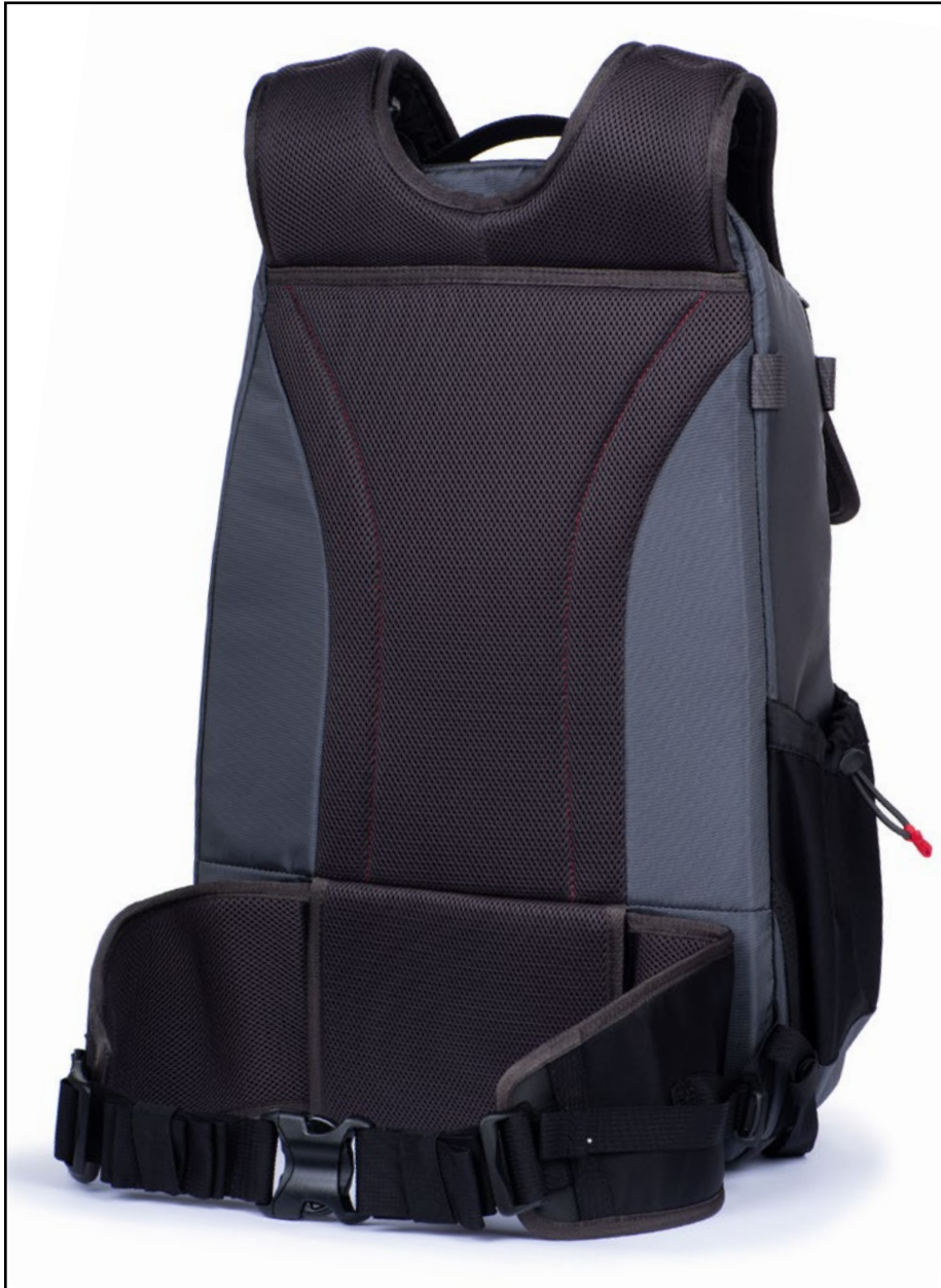
Breathable 320G air-mesh back panel keeps your back cool during long days