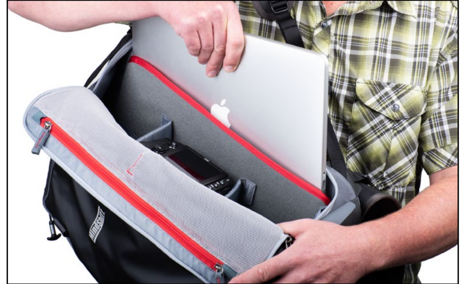
Dedicated, padded pocket fits 15" laptop