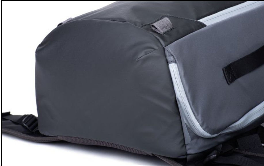
Waterproof, heavy-duty Tarpaulin base