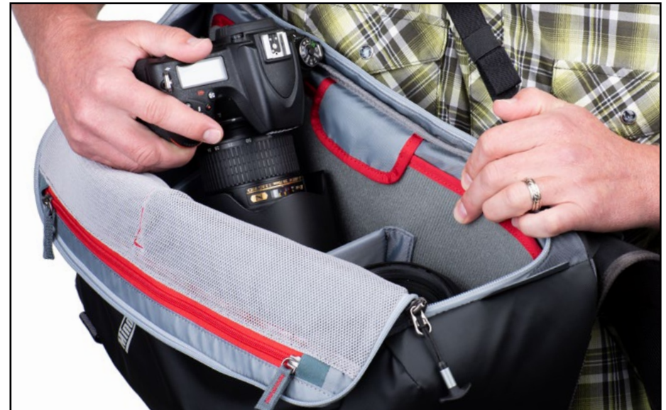
Extra-large side panel gives you complete access to all your gear