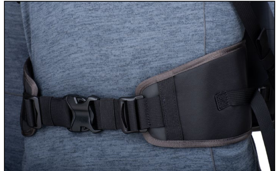
Waist belt is wide and removable providing comfort and flexibility