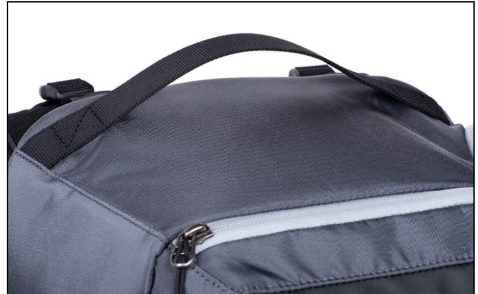
Top and side carry-handles