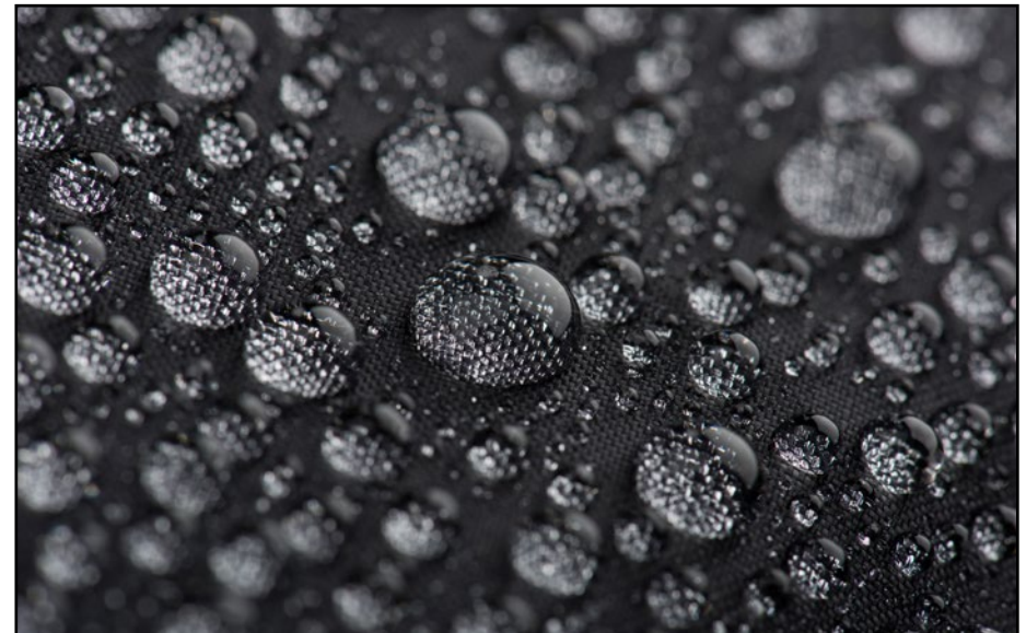
Seam-sealed rain cover included for downpour conditions