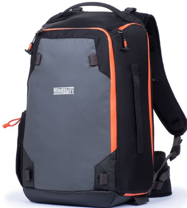
PhotoCross Backpack 15 Orange Ember

The PhotoCross is built to withstand the elements, yet comfortable enough to wear on long days in the field. The extra-large side panel gives you complete access to your gear when you're ready to take the shot.