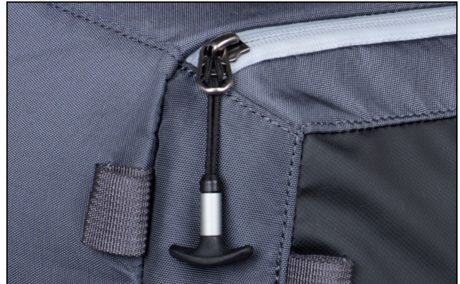
T-pulls are easily gripped with or without gloves