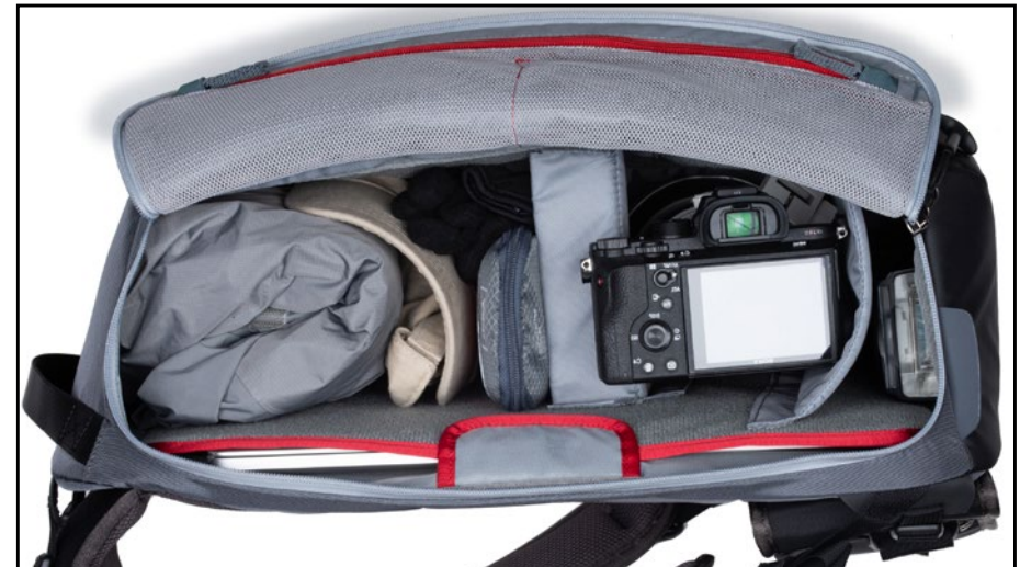
Sony A7RII with 70–200mm f/2.8 attached, a flash and personal gear