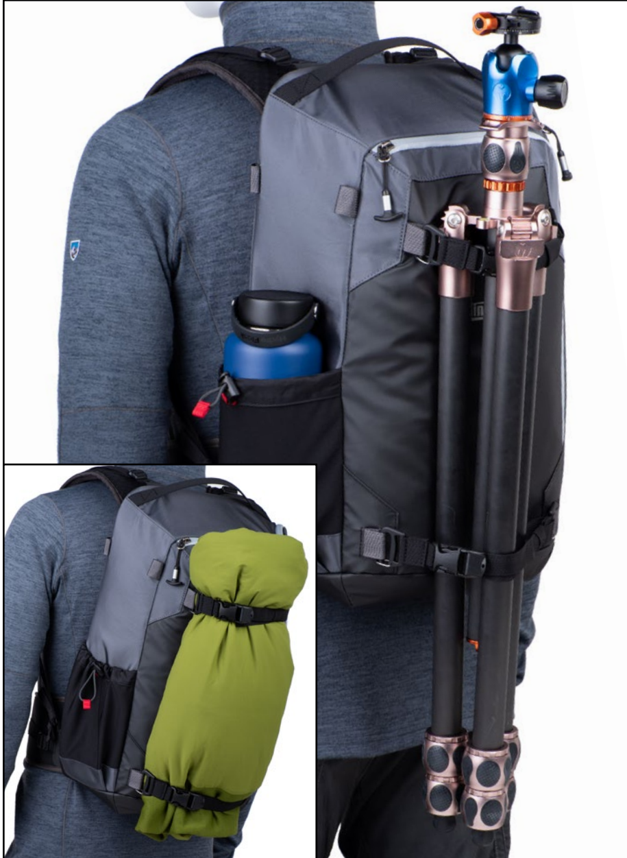
Tripod or jacket carry with included straps