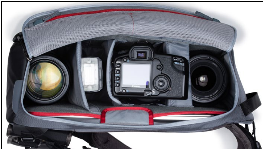
Canon 5D with 24–70mm f/2.8 attached (hood extended), 70–200mm f/2.8 (hood reversed), 16–35mm f/2.8 and a flash