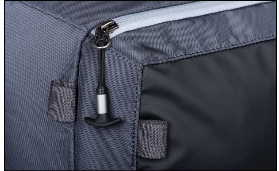
Durable materials provide abrasion resistance