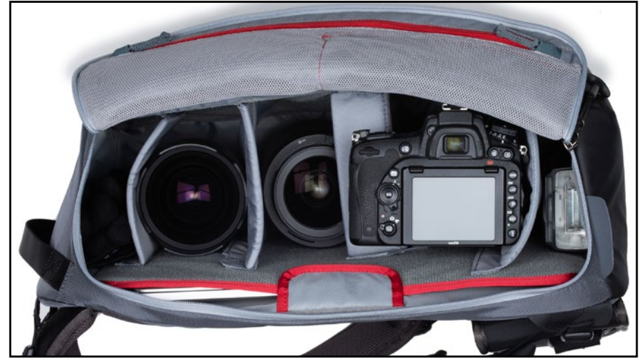
Nikon D810 with 70–200mm f/2.8 attached, 24–70mm f/2.8 attached, 14–24mm f/2.8 and a flash (hoods reversed)