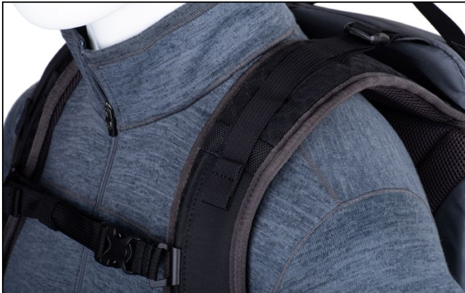
Wide, body-forming shoulder straps provide superior comfort